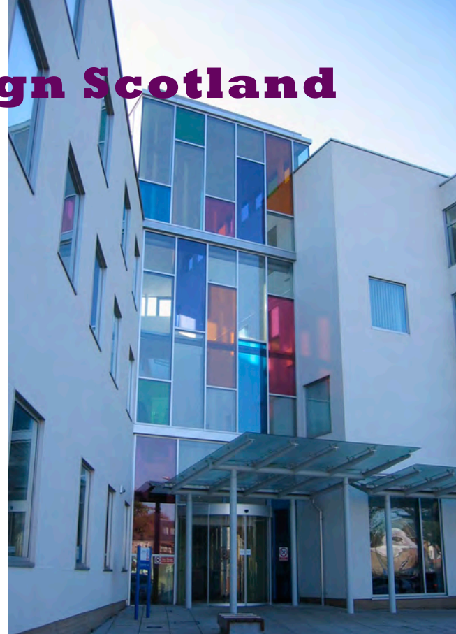
Heart of Hounslow

Further information on the case studies can be found on Architecture + Design Scotland's website www.ads.org.uk